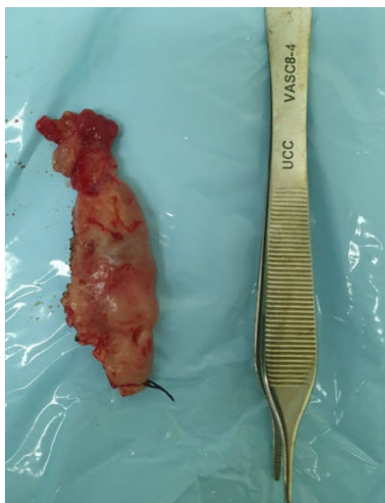
Figure 3 - Salpingectomy specimen

ted to be 1 in 30,000 in spontaneous pregnancies, but in pregnancies conceived using assisted reproductive techniques, it is reported to be as high as 1 in 100 (4) .